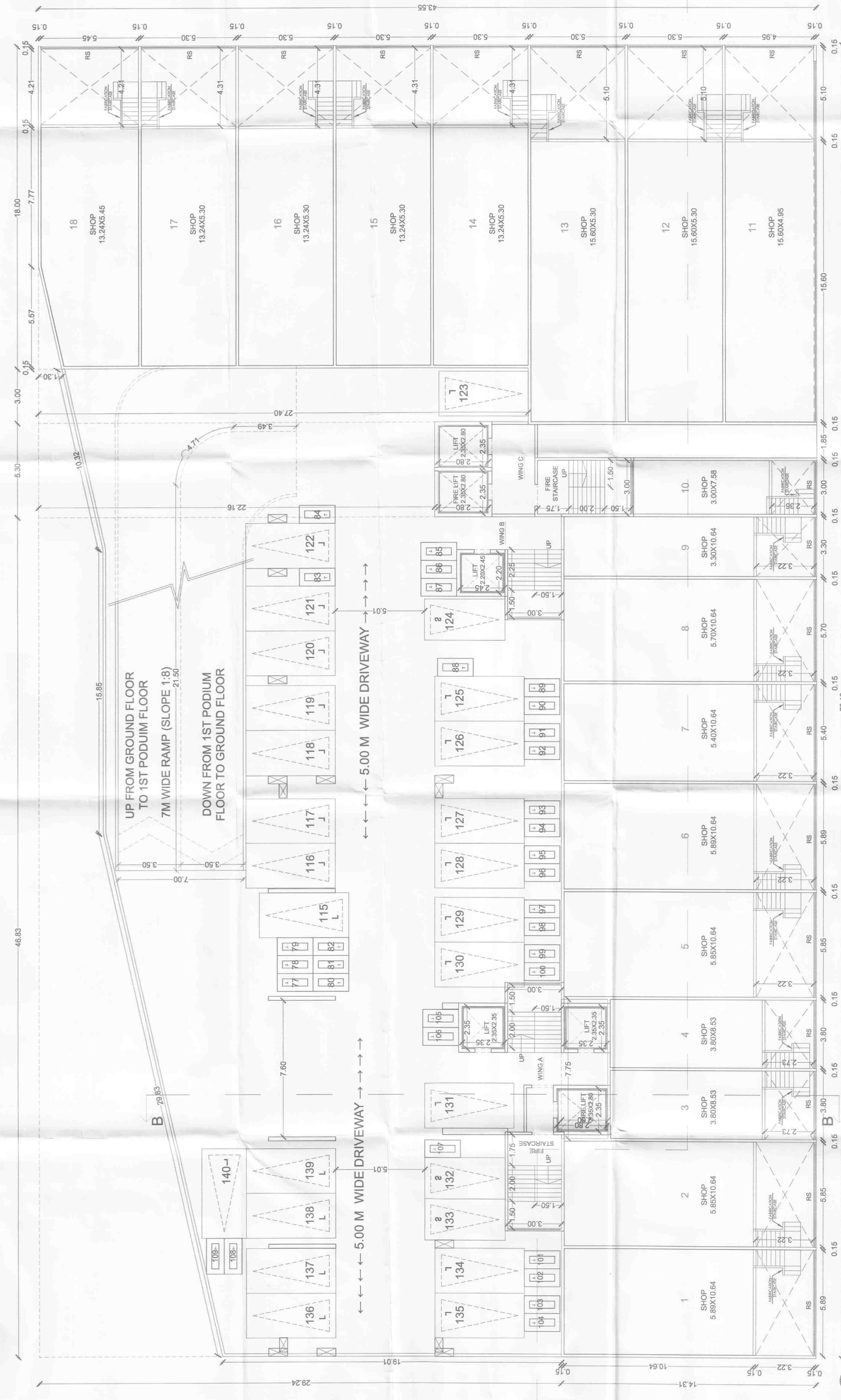
1ST FLOOR PLAN (SCALE 1:100)