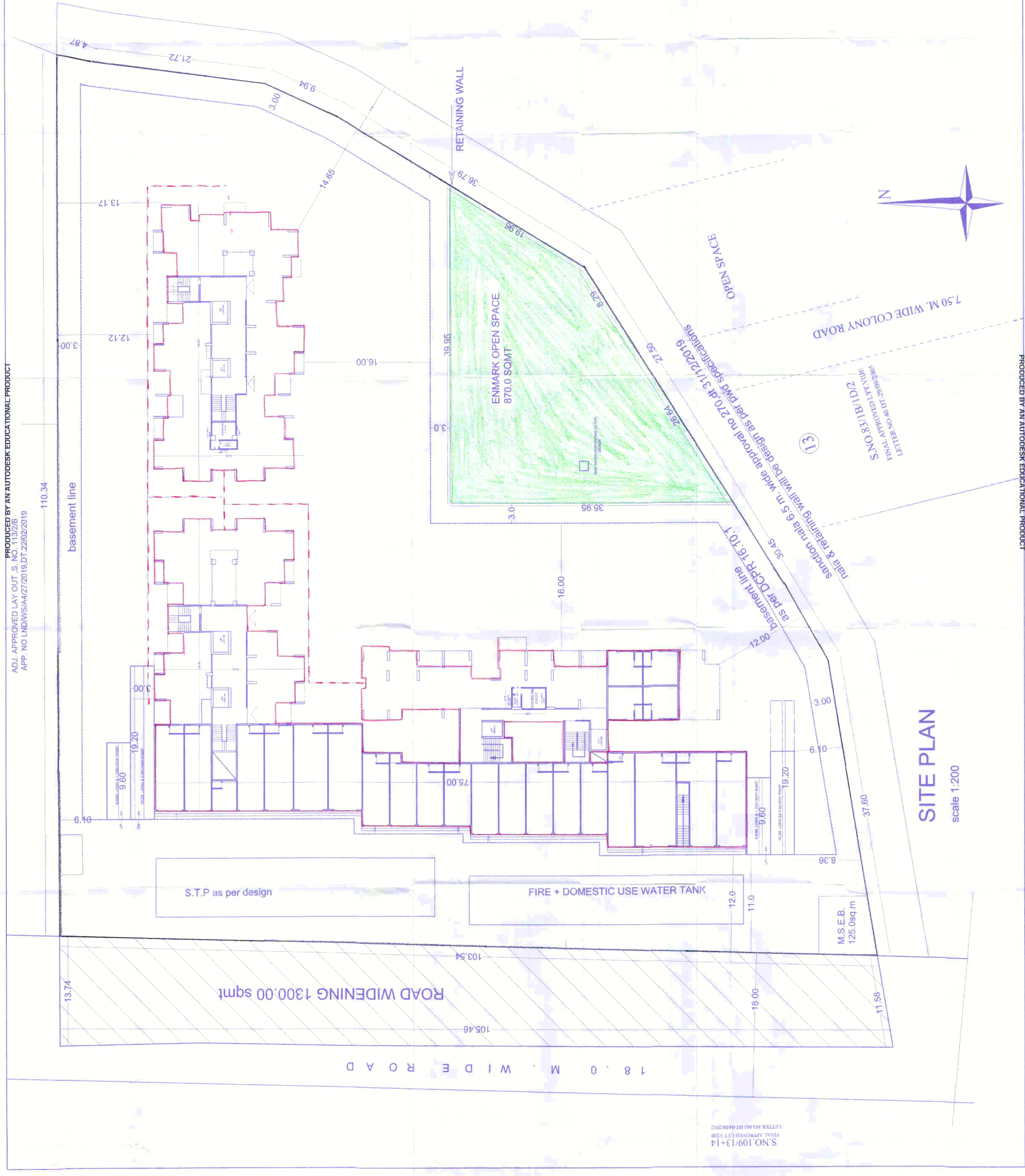
SITE PLAN scale 1:200

PRODUCED BY AN AUTODESK EDUCATIONAL PRODUCT ADJ. APPROVED LAY OUT S. NO. 113/2/B APP. NO. LNDWS/A/27/2019, DT. 22/02/2019