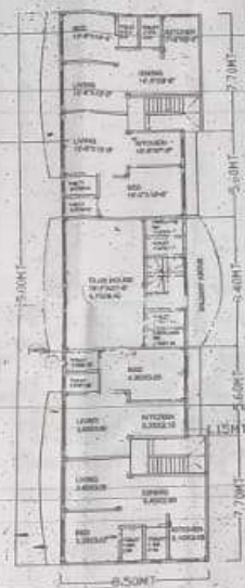
GROUND FLOOR PLAN RESIDENTIAL AREA - 213.22 SQ.MT. CLUB HOUSE AREA - 61.74 SQ.MT. TOTAL AREA RESIDENTIAL - 274.96 SQ.MT. (B' TYPE APARTMENT)