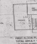
FIRST FLOOR PLAN - AREA 47.34 SQ.MT. TOTAL AREA = 126.86 SQ.MT. (B' TYPE BUNGALOW)