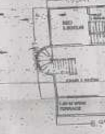
FIRST FLOOR PLAN - AREA 75.28 SQ.MT. TOTAL AREA 160.67 SQ.MT. (A' TYPE BUNGALOW)

PLOT AREA CALCULATION ROAD WIDENING AREA A) 0.50 X 74.00 X 19.00 = 703.00 SQ.MT. B) 0.50 X 74.00 X 19.00 = 703.00 SQ.MT. TOTAL AREA OF ROAD WIDENING = 1406.00 SQ.MT. GREEN BELT AREA A) 0.50 X 82.00 X 38.50 = 1496.50 SQ.MT. B) 0.50 X 82.00 X 38.50 = 1496.50 SQ.MT. TOTAL AREA OF GREEN BELT = 2993.00 SQ.MT. PLOT NO. 1 A) 0.50 X 81.00 X 27.00 = 823.50 SQ.MT. B) 0.50 X 81.00 X 27.00 = 823.50 SQ.MT. AREA OF PLOT NO. 1 = 1647.00 SQ.MT.