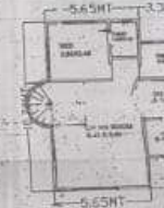
GROUND FLOOR PLAN AREA 85.37 SQ.MT.