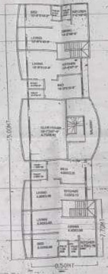
FIRST FLOOR PLAN RESIDENTIAL AREA - 113.13 SQ.MT. CLUB HOUSE AREA - 61.74 SQ.MT. TOTAL AREA CLUB HOUSE - 124.88 SQ.MT.