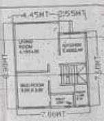
GROUND FLOOR PLAN AREA 36.54 SQ.MT.