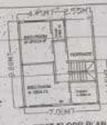
FIRST FLOOR PLAN - AREA 30.51 SQ.MT. TOTAL AREA = 199.05 SQ.MT. (E' TYPE BUNGALOW)