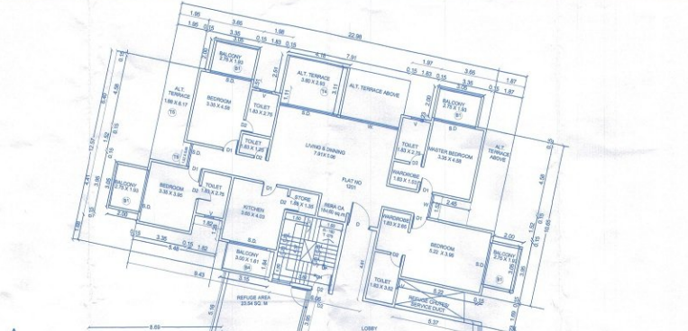
TYPICAL 12 FLOOR PLAN WITH REFUGE AREA SCALE: 1:100