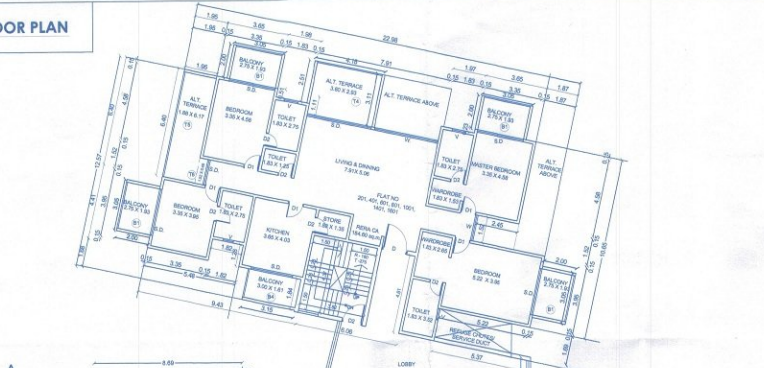
TYPICAL 2,4,6,8,10,12,14,16 FLOOR PLAN SCALE: 1:100

APPROVED The Plans amended in ..... As per the conditions Mentioned in the accompanying commencement Certificate (No. ....) dated ..... 11/05/2022 04/05/2020 Executive Engineer TOWN PLANNING Nashik Municipal Corporation Nashik