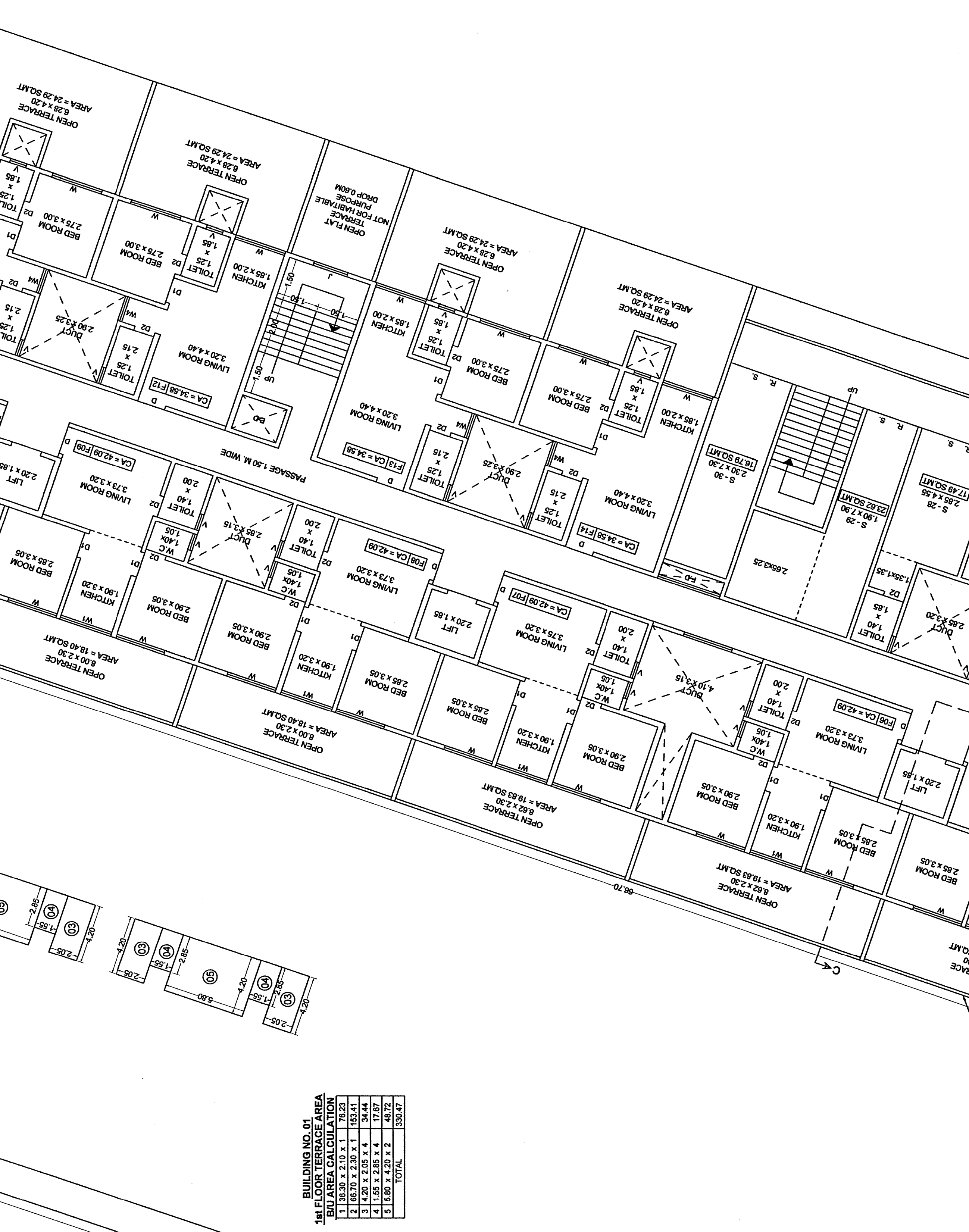
LINE DIAGRAM OF 1st FLOOR TERRACE OF BLDG. 01 FOR B/U AREA CALCULATION PURPOSE (SCALE 1:200)