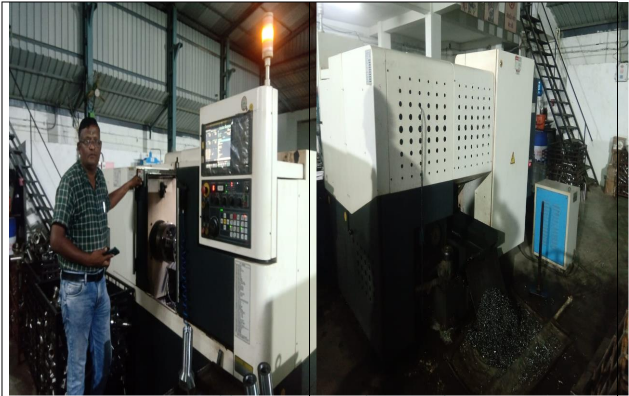
View of ACE CNC Lathe, Model- Super Jobber 500, Sr. No. 4271, YOM-2020