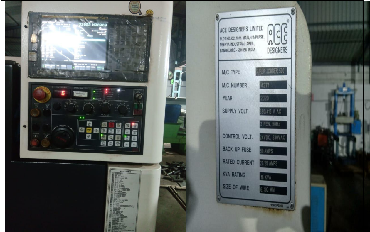
View of ACE CNC Lathe, Model- Super Jobber 500, Sr. No. 4271, YOM-2020