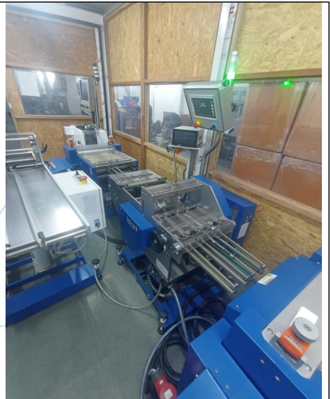
View of H&H Folding Machine T20 with Standard Accessories