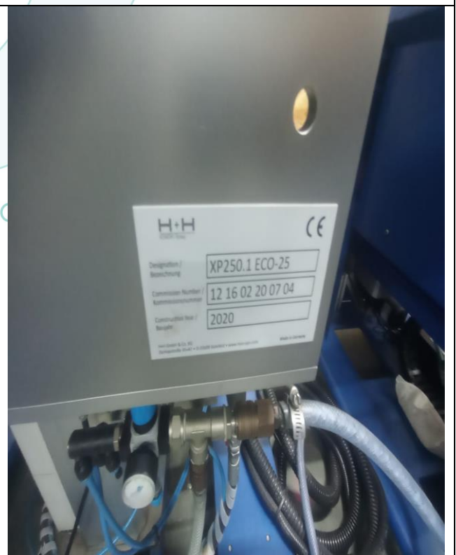
Machine Name Plate