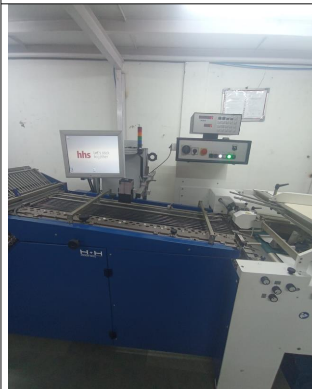
View of H&H Folding Machine T20 with Standard Accessories