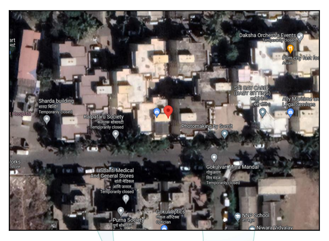
Note: Red marks shows the exact location of the property