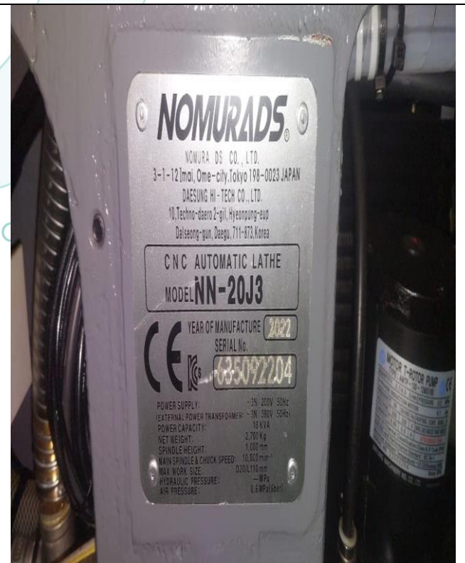
Machine Name Plate