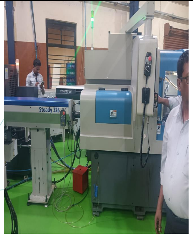
View of Nomura DS Lathe Model NN-20J3 (Fanuc OiTF Plus) Sr. No. 635092204