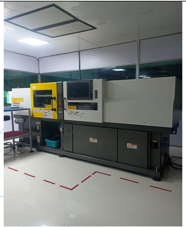
View of Injection Moulding Machine, Fanuc Roboshot Alpha S50iB, Sr. No. A216P2560