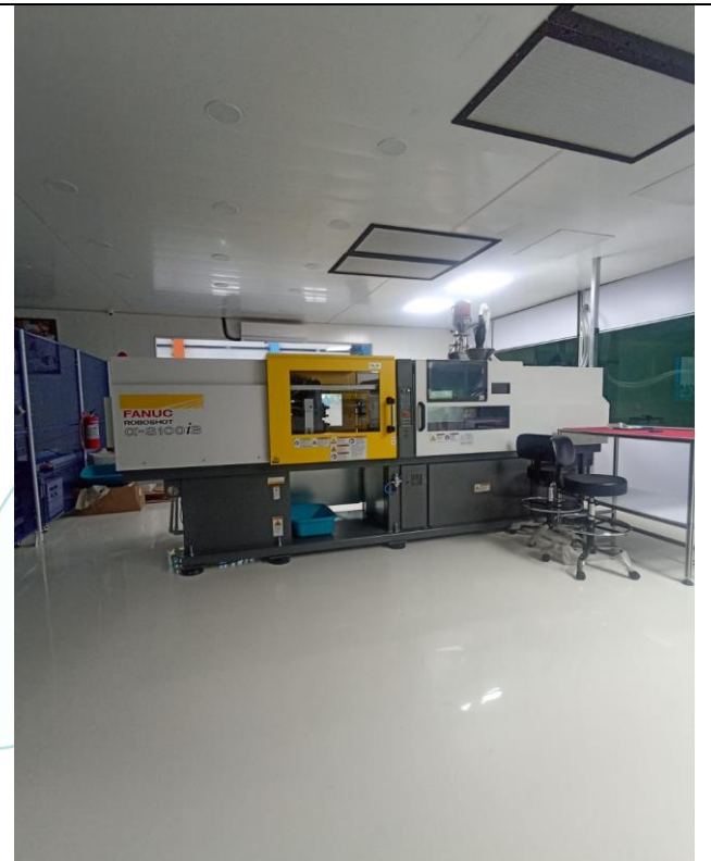
View of Injection Moulding Machine, Fancu Roboshot Alpha S100iB (125 Ton)