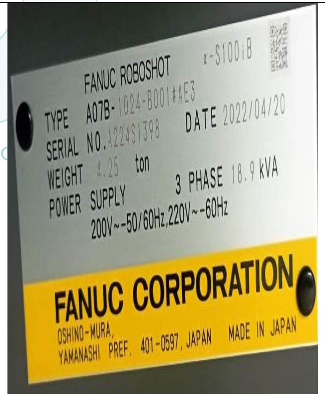
View of Injection Moulding Machine, Fancu Roboshot Alpha S100iB (125 Ton)