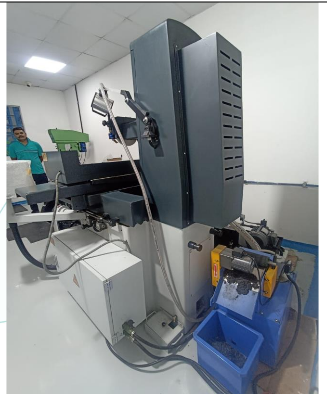
View of Phillips Brand Precision Surface Grinder, Model-PSG-2550AHD, Sr. No. P4 GR 10744