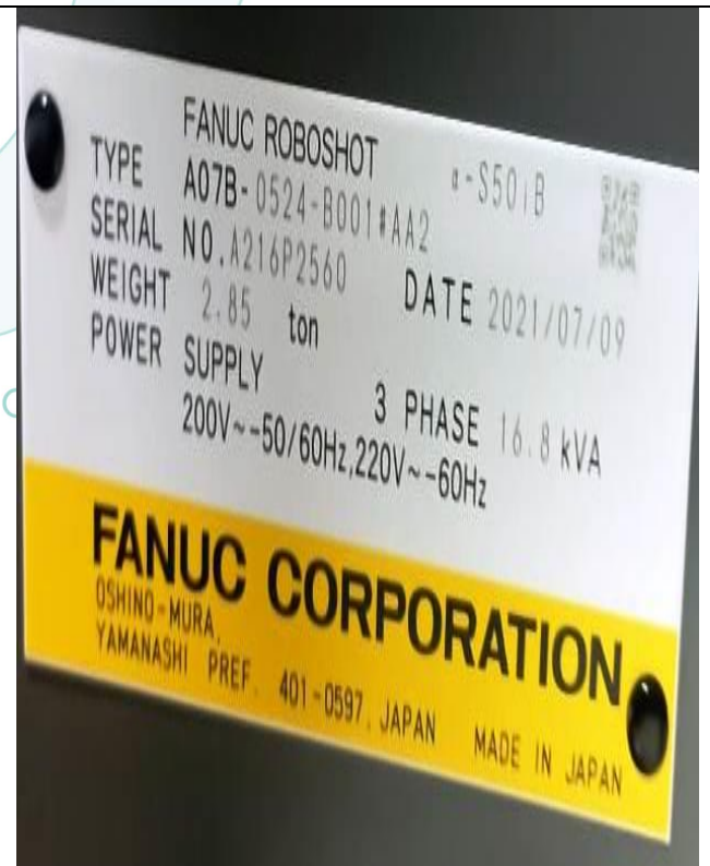
View of Injection Moulding Machine, Fanuc Roboshot Alpha S50iB, Sr. No. A216P2560