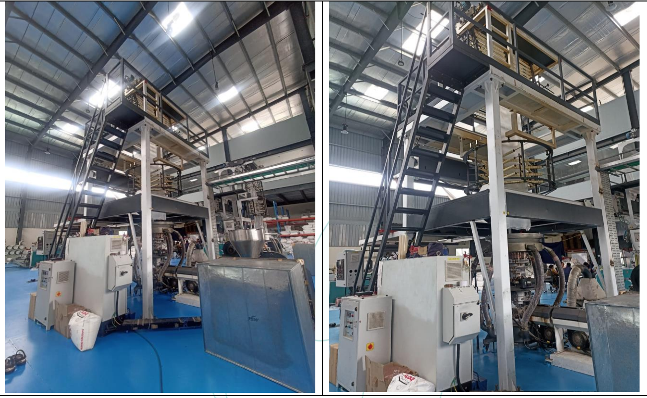
View of Plastic Processing Extrusion Machine, Maxima: 1600/ 65HS+, Sr. No. 26