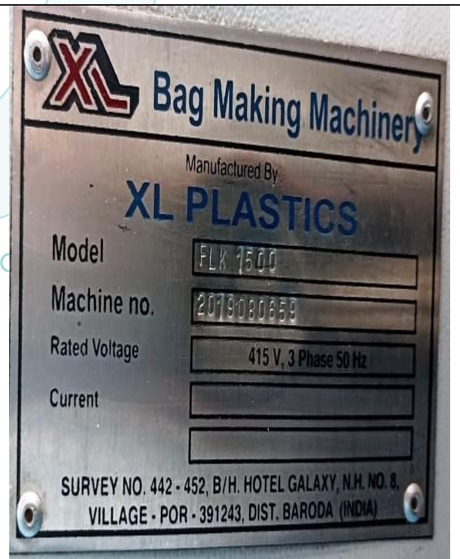
View of Heavy-Duty Bottom Seal Bag Making Machine, Model FLK1500