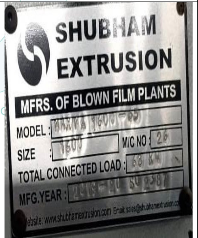
Machine Name Plate