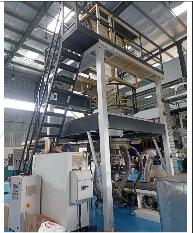
View of Plastic Processing Extrusion Machine, Maxima: 1600/ 65HS+, Sr. No. 26