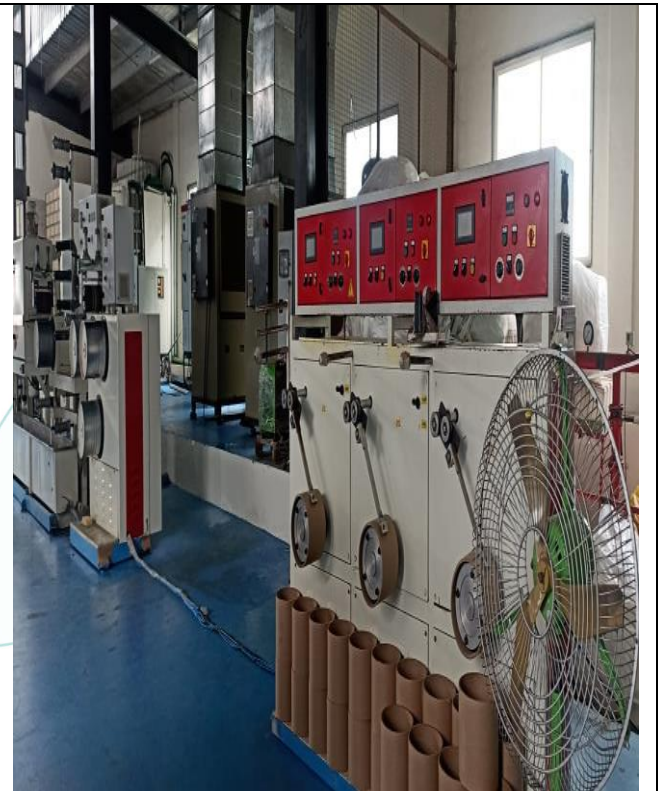
View of Fully Automatic Box Strapping Plant- 75mm, Model No. KPPL PEBS