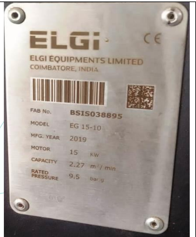
View of EG 15-10 400V/50 Hz Screw Air Compressor, Fab No. BSIS038895