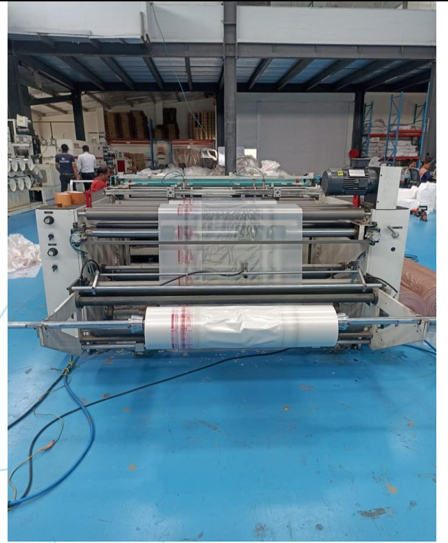
View of Heavy-Duty Bottom Seal Bag Making Machine, Model FLK1500, Sr. No. 2019080659