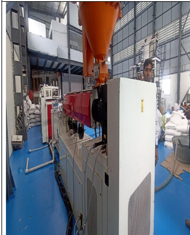
View of Fully Automatic Box Strapping Plant- 75mm, Model No. KPPL PEBS