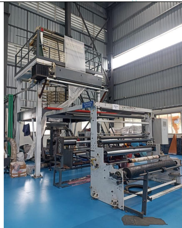
View of Plastic Processing Extrusion Machine, Maxima: 1600/ 65HS+, Sr. No. 26