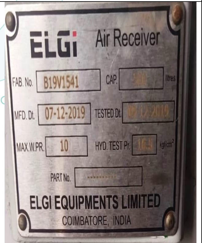
View of Air Receiver VA 00 020 500L 10 ASME 2062V, Fab No.-B19V1541