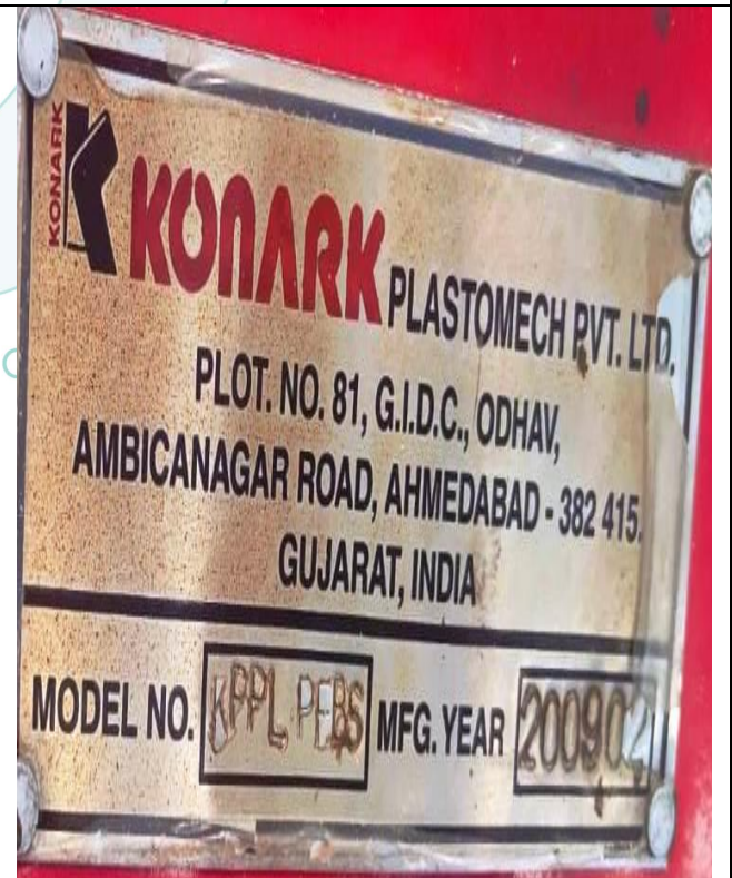
Machine Name Plate