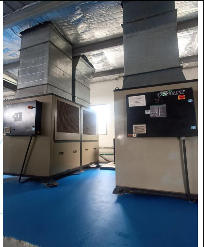
View of Air Cooled Water Chiller EP2A-12 with by pass assembly & Y-Strainer, Sr. No. 3501/07/2019