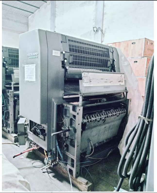
View of Used Heidelberg CD 102-6+L Printing Machine