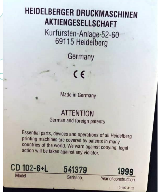
Machine Name Plate