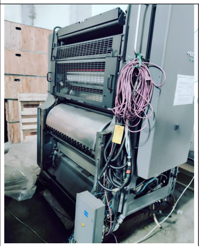
View of Used Heidelberg CD 102-6+L Printing Machine