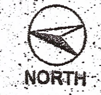
LAYOUT PLAN SCALE: 1:2000

सूचना का अधिकार अन्तर्गत प्रस्तावों की जाया प्रति प्रकाशित हुई। सहायक लोकसुचना अधिकारी प. नगर तथा ग्राम विकास जिला कार्यालय, इन्दौर for Satya Infrastructures Limited Authorised Signatory