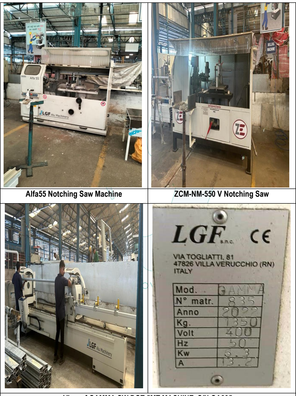
View of GAMMA SW DGT 5MT MACHINE, S/N GA835