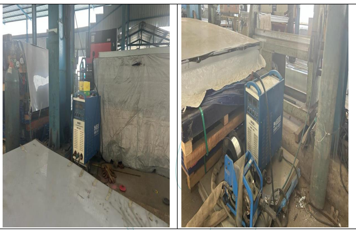
Warpp- - Mig Welding Machine 400 Amp at Wada Factory