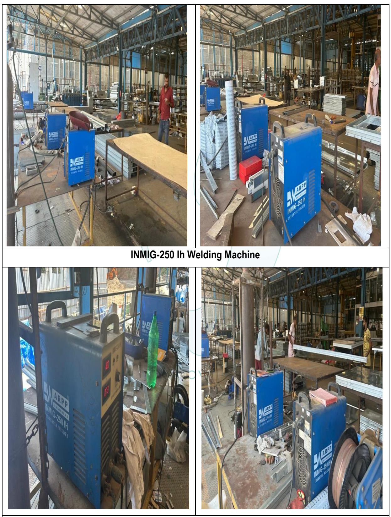
INMIG-250 Ih Welding Machine