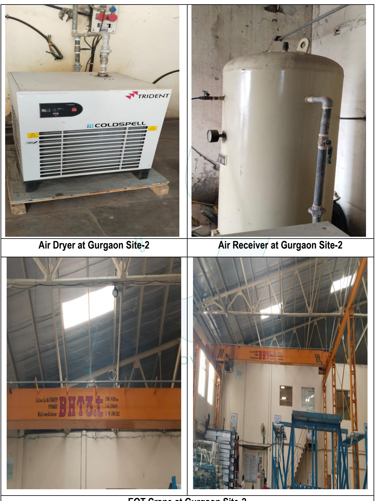
EOT Crane at Gurgaon Site-2