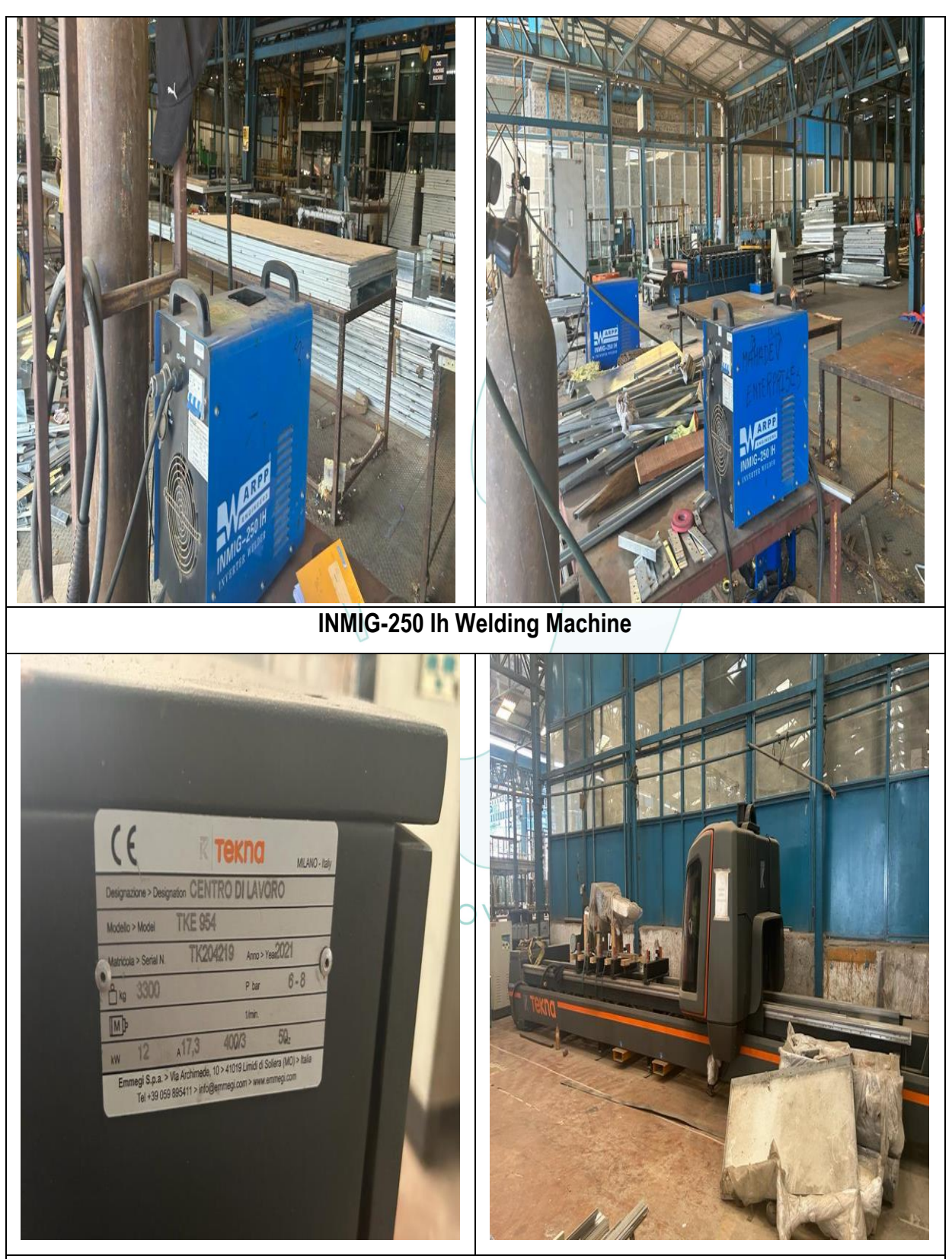
Used Tekna 954-7.7 Meters 4 AXIS Machining Center, YOM-2021