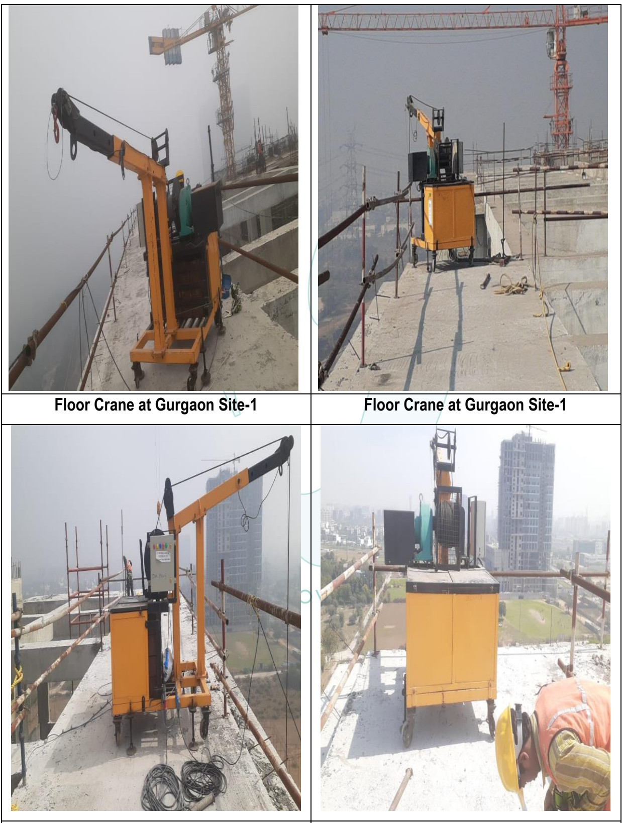
Floor Crane at Gurgaon Site-1