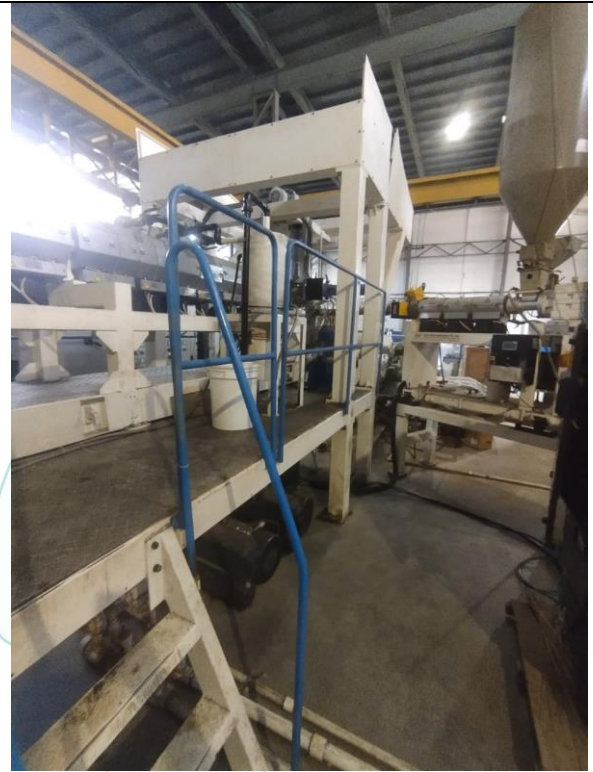
View of Three Layer Sheet extrusion Line, Model- RRSL 90/45V3-50/26 (800 mm) SP Series